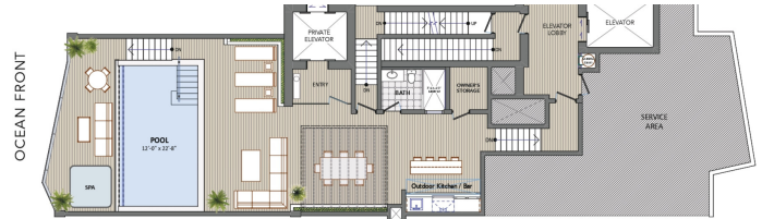
Sky Villa 3 Upper Level Floor Plan Schedule 'B1'

Lower Level Area 2,500 Sq.Ft. Upper Level Area 1,872 Sq.Ft. Total Villa Area 4,372 Sq.Ft.