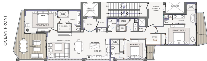
Sky Villa 3 Lower Level Floor Plan Schedule 'B'

( Design in baths / utility room & support columns may change due to mechanical / structural requirements ) Villa square foot totals do not include common Stairwells, Landings, or Service Elevator Lobby